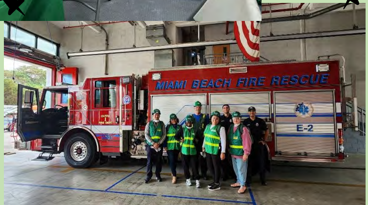
January 2024 CERT Class