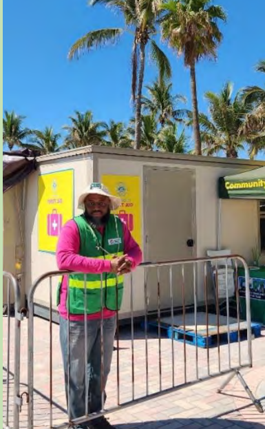
2024 Spring Break Rehab Fort